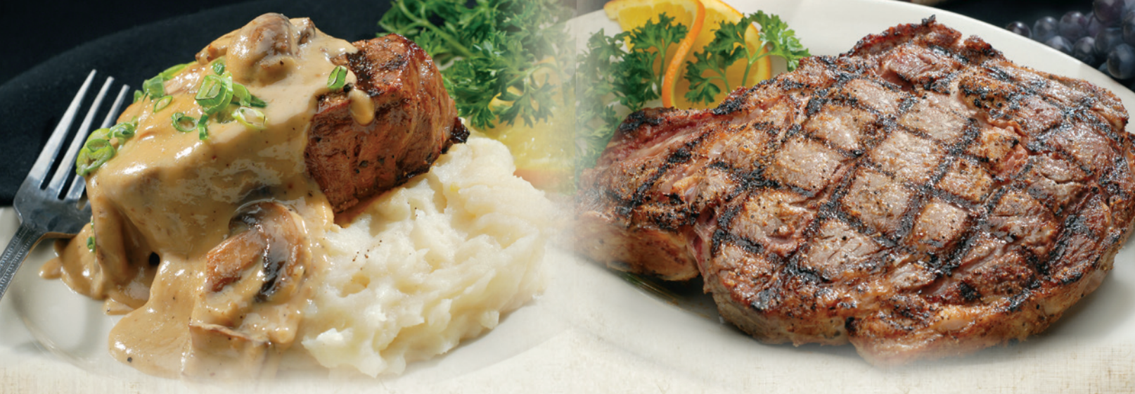
Roasted Garlic Cream Filet